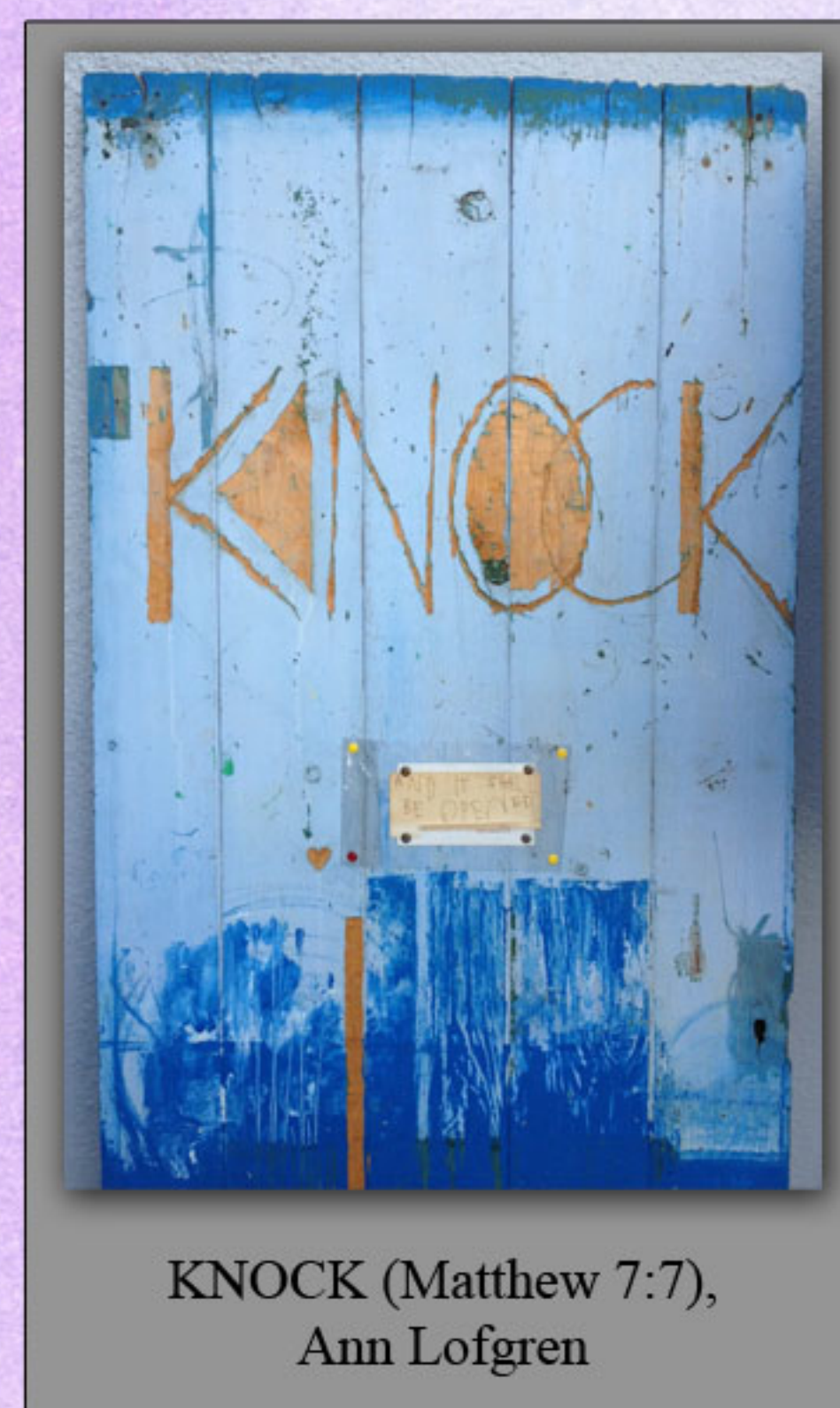
KNOCK (Matthew 7:7), Ann Lofgren

The artistic focus of the exhibiton is on sacred text, with 130 works of art on display including calligraphy, needlework, paintings on silk, oil paintings, watercolor, photography, quilts, stained glass, sculpture, clay, digital art, and paper collage. Each work somehow incorporates words, text or letters in unique expressions that underscore interfaith understanding, spirituality, peace and cultural dialogue.