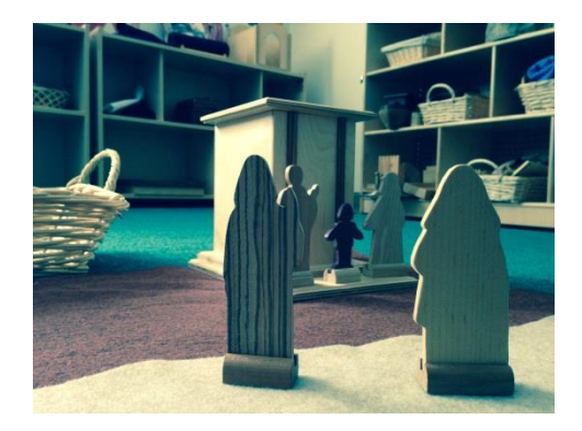
The Story of the Boy Jesus in the Temple