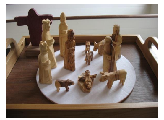
The Story of the Holy Family